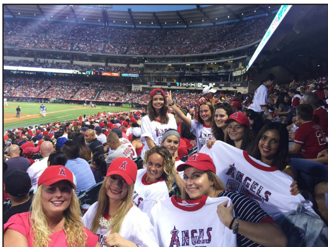
The Orange County Au Pairs look so cute in their Angel's outfits.