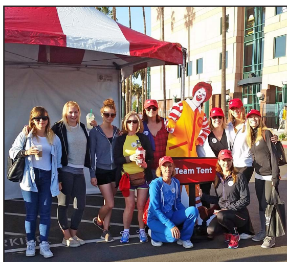
Team EurAupair supported the Ronald McDonald House participating in the 5-k Walk for Kids in Anaheim, CA in April! Go EurAupair!!