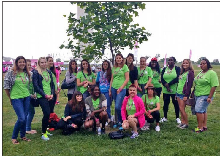
The enthusiastic team of Au Pairs, Community Counselors and Area Coordinators.